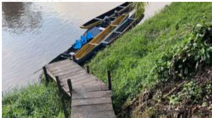
A wooden path to the riverbank in Darién Province, Panama, where canoes await transport to communities accessible only by boat.

Due to close collaboration with the community, these shared inputs resulted in strong and context-aware outputs, including a solar-powered water treatment facility, pipelines, and storage tanks. Local leaders were trained in operation, maintenance, and routine checks. Community members engaged in material transport, building, and hygiene education. They weren't passive beneficiaries; they were co-builders.